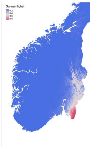
Figure 2. Estimated distribution of wild boar in 2021. The map shows the probability that wild boar is present in a blue (low probability) to red (high probability) scale. The model is based on observations of wild boar from SCANDCAM, species observations and locations of wild boar shot during hunting and reported dead from other causes (Odden et al. 2023). The map is prepared by NINA.